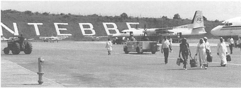
THE WORLD-RENOVED ENTEBBE AIRPORT IN UGANDA

considerable social turbulence has followed the introduction of a multiparty system of government, and the present government is accused of violating the human rights of the leaders of the opposition party.